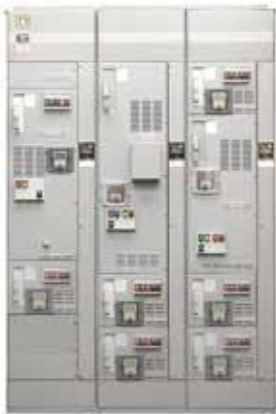
Model 6 MCC (UL and CSA approved)