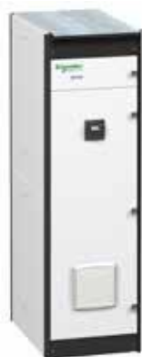
Okken / Blokset (IEC61439 certified)